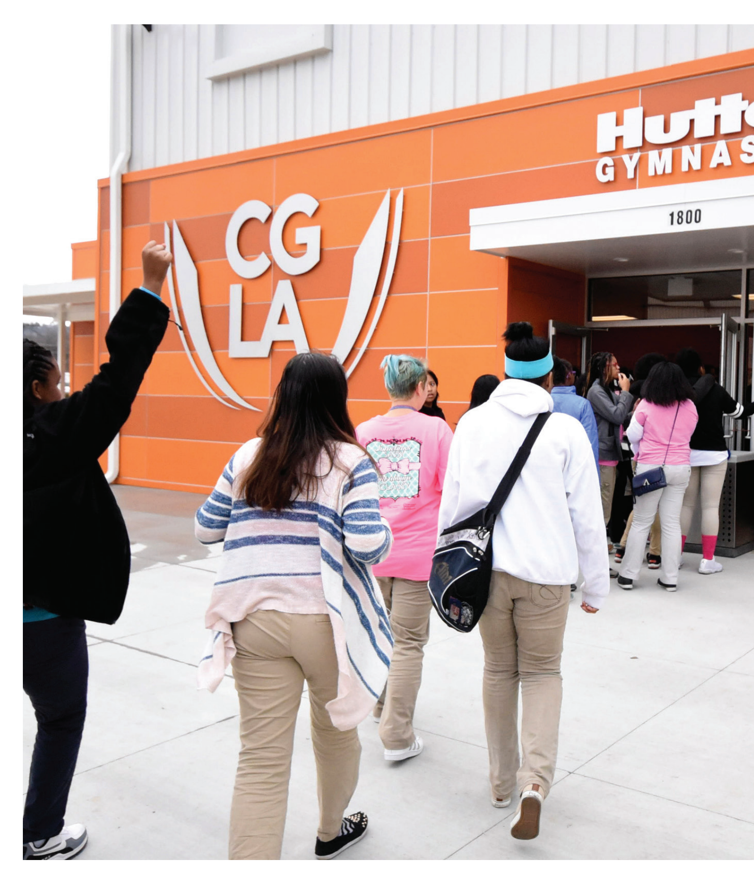
Chattanooga Girls Leadership Academy.