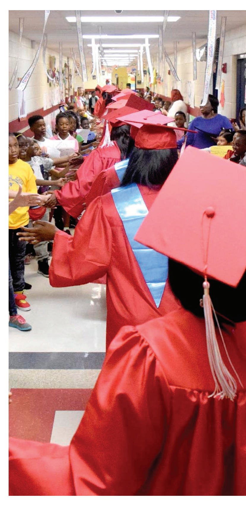
Brainerd High seniors pass cheering students at Orchard Knob Elementary.

Alongside these financial obstacles, students also frequently voiced how overwhelmed they were with all their educational, work, and extracurricular obligations; many had to sacrifice social lives in order to balance all their obligations, threatening burnout at a very young age. Finally, even after overcoming all these barriers, young people in Chattanooga often faced difficulties breaking through the social networks that appear closed to them to gain employment, even after college graduation. In the following section, the input of local companies hiring entry-level workers further explains factors influencing youths' opportunities in Chattanooga.