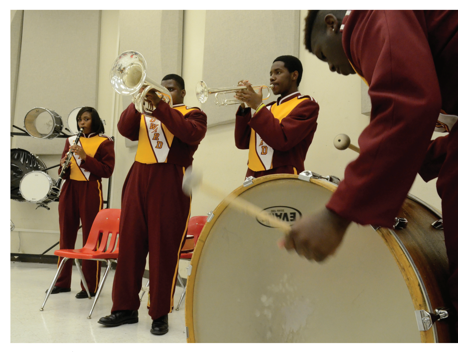
The Howard School band practicing using new donated instruments.

file... We're sending these kids out in the world in the 21st century." This sentiment was echoed by a number of employers who pointed out that many young people were unprepared to perform basic administrative tasks, such as drafting emails, mailing letters, writing resumes, and communicating clearly.